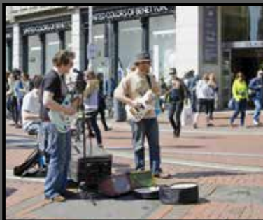
Grafton Street - 10 mins