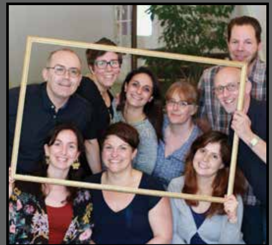
The Horner Team

Excellent student support, central Dublin location, small class groups, fantastic nationality mix, quality buildings / facilities, professional native English teachers, wonderful host families, city residence and apartments are all key elements.