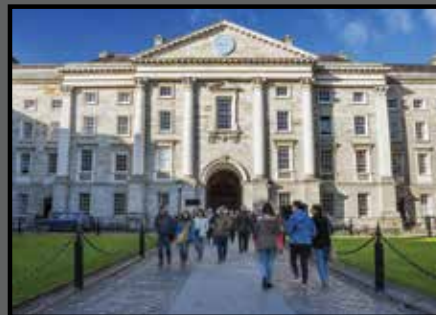
Trinity College - 10 mins