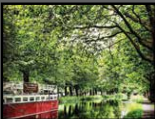
Grand Canal - 4 mins