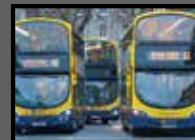
Bus & Train - 5/10 mins