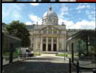
Parliament - 5 mins