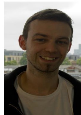
Nic Student Support