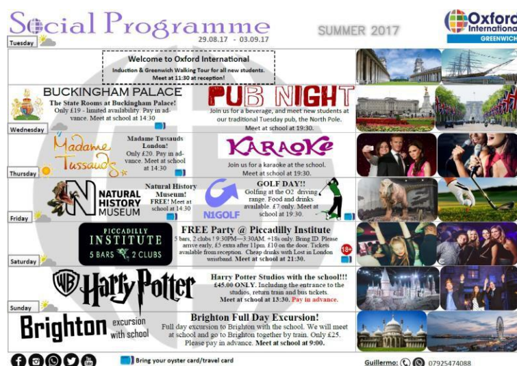
Sample Social Programme

And don't forget our famous Boat Parties!