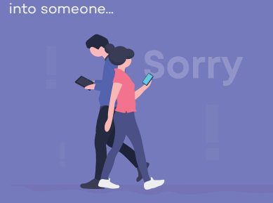
...or even if they bump into you!