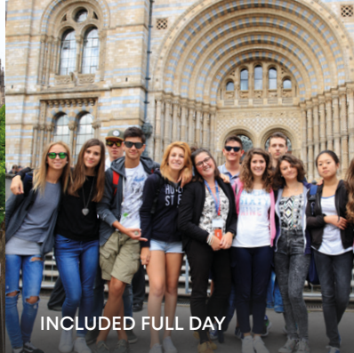
INCLUDED FULL DAY