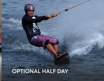
OPTIONAL HALF DAY