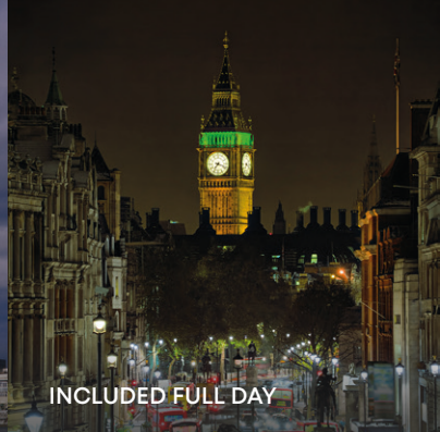
INCLUDED FULL DAY