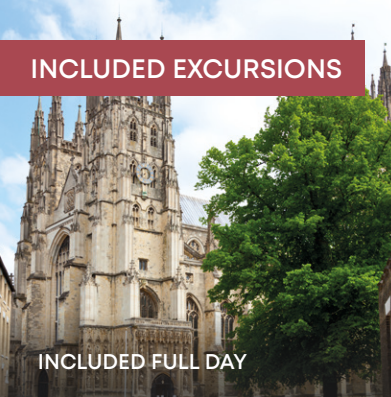
INCLUDED FULL DAY