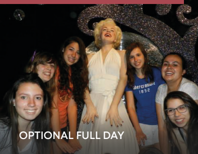
OPTIONAL FULL DAY