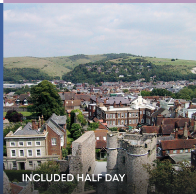
INCLUDED HALF DAY