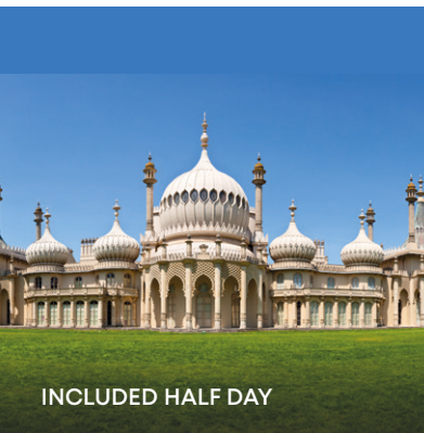
INCLUDED HALF DAY

Packed meal included. This excursion is approximately 9 hours of which up to 3 hours is travel time.