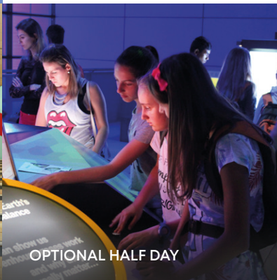
OPTIONAL HALF DAY