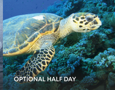
OPTIONAL HALF DAY