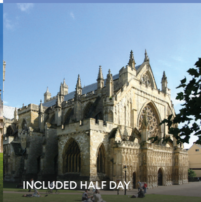
INCLUDED HALF DAY