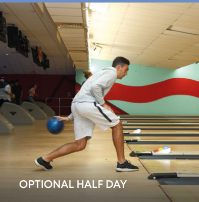
OPTIONAL HALF DAY

Packed meal included. This excursion is approximately 6 hours of which up to 1 hour is travel time.