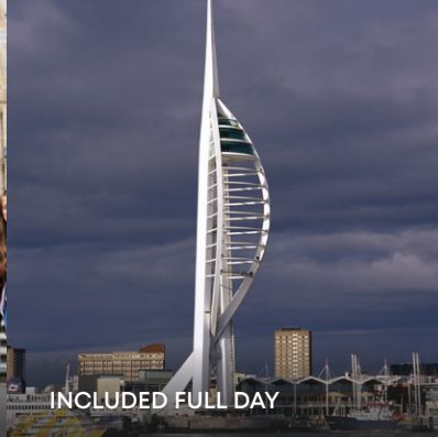
INCLUDED FULL DAY