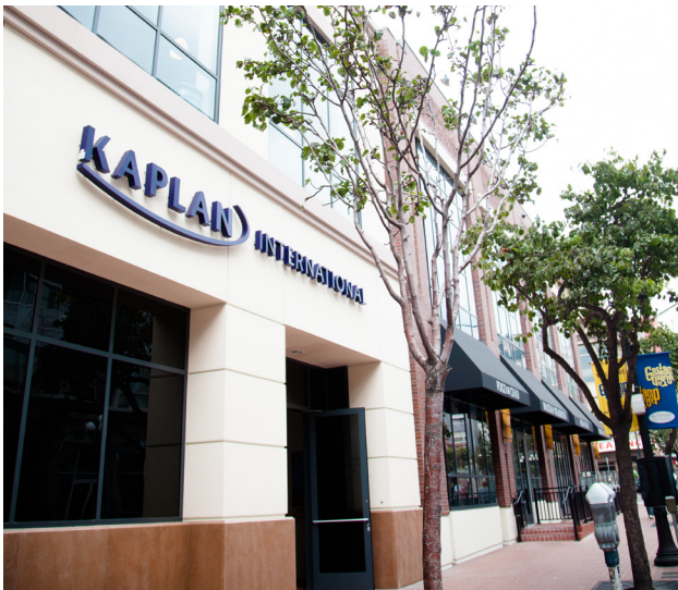
Kaplan International San Diego Exterior

The city is an outdoor recreational paradise (hiking, biking, surfing, skate boarding, jogging, sailing and other water sport). Students can visit famous attractions like SeaWorld, San Diego Zoo/ Safari Park, Balboa Park, historic Old Town/Presidio Park, Little Italy and the downtown Gaslamp district (restaurants, shopping, theaters and nightclubs). The city also offers a rich cultural and ethnic population, which is reflected in friendly people, a thriving art and cultural scene and wonderful restaurants, museums and shops. Finally, there is thriving nightlife in Pacific Beach, Hillcrest and Downtown. Los Angeles, Palm Springs, Santa Barbara, Baja California, Mexico and Las Vegas are all within driving distance of San Diego for fun weekend getaways.