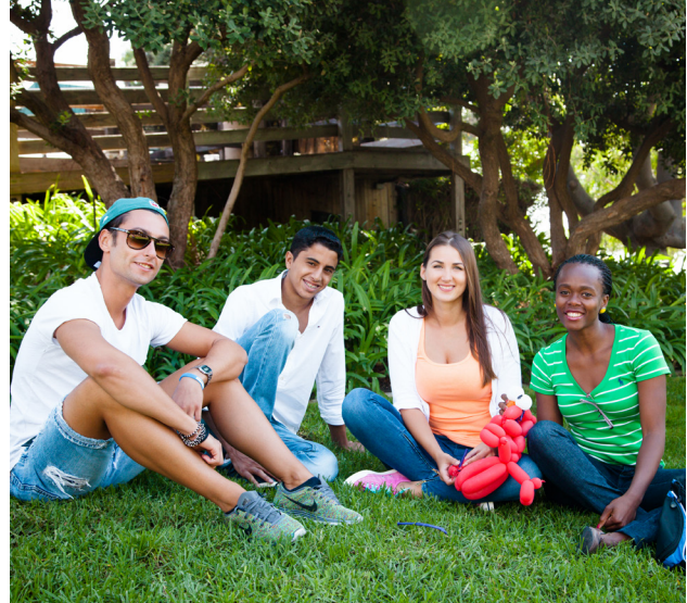
Activities with students

Taxi – approximately $35-$65 (+ 15% gratuity)