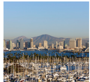
San Diego skyline