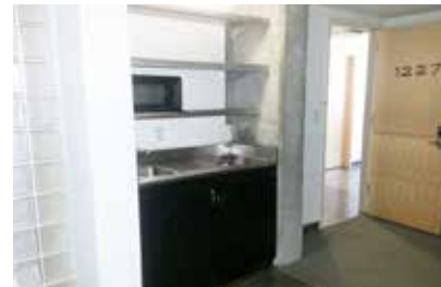
Shared living area