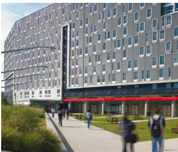
Exterior view of The Edge Student Residence

The Edge Student Residence is approximately 15-20 minutes from the Kaplan International Philadelphia school by public transit: bus or subway.