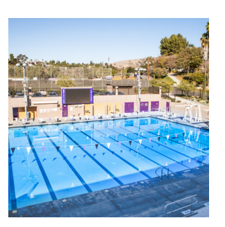
College swimming pool

Department stores and supermarkets are located within walking distance of the center. There are also several department stores/malls within a short bus ride (30 minutes).