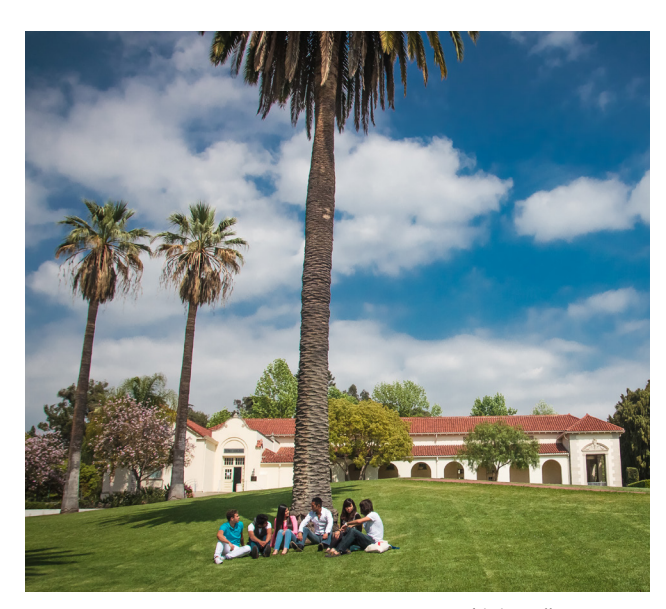
Whittier College campus

Founded in 1901, Whittier College has been recognized as one of the best small colleges in the USA. Whittier College is a selective, independent, four-year college that offers a nationally recognized liberal arts curriculum, a vibrant campus community and a strong academic tradition. Kaplan International Whittier was founded in 1989.