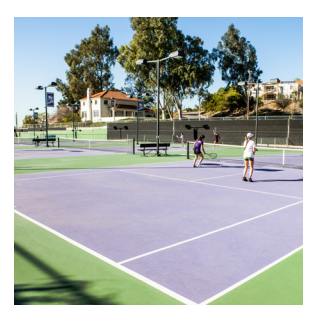
College tennis courts