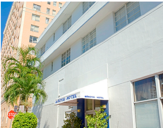
The Royal Hotel

The Royal is ideal for students who want to be close to fun and the sand. Students will need to travel 30-60 minutes to the Kaplan International Miami school in Coral Gables.