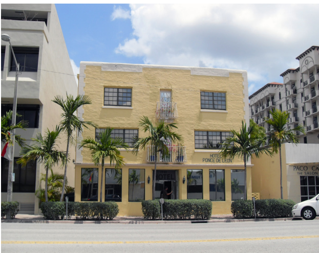
Ponce De Leon Hotel

The Ponce De Leon is ideal for students who want to be close to school. A free trolley ride takes you straight to the Kaplan International Miami school, which is located just 5-10 minutes down the same street, Ponce De Leon Boulevard. This pedestrian friendly area is also 45 minutes away by car from Miami Beach, Downtown Miami, and other South Florida attractions.