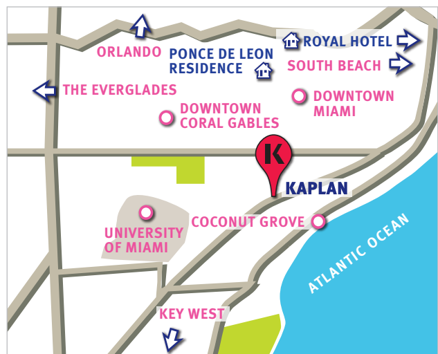
Location of Ponce De Leon Hotel and Kaplan Miami school

Ponce De Leon Hotel 1721 Ponce De Leon Blvd. Coral Gables FL 33134