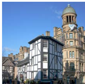
Manchester city center