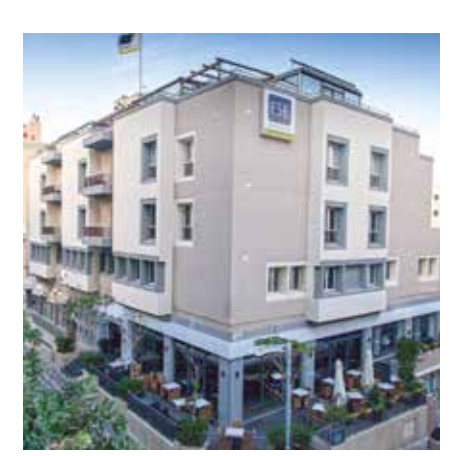
ESE Paceville School

WI-FI IS FREE AT ESE PACEVILLE SCHOOL, RESIDENCES AND APARTMENTS.