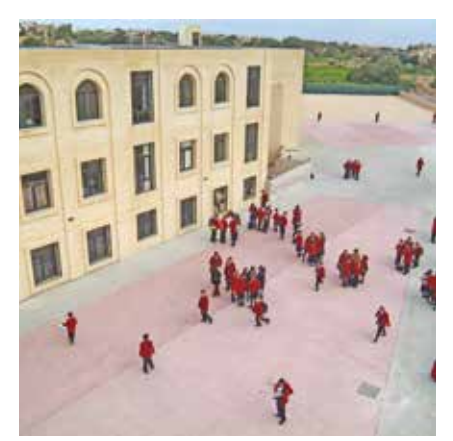
ESE Naxxar School